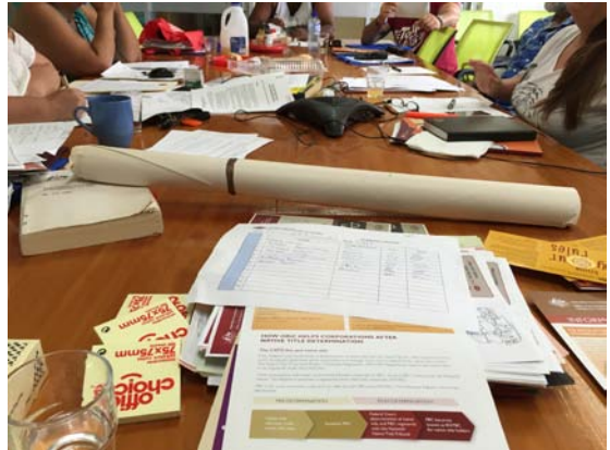
Native title discussion.

As at 30 June 2016 there were a total of 26 policy statements.