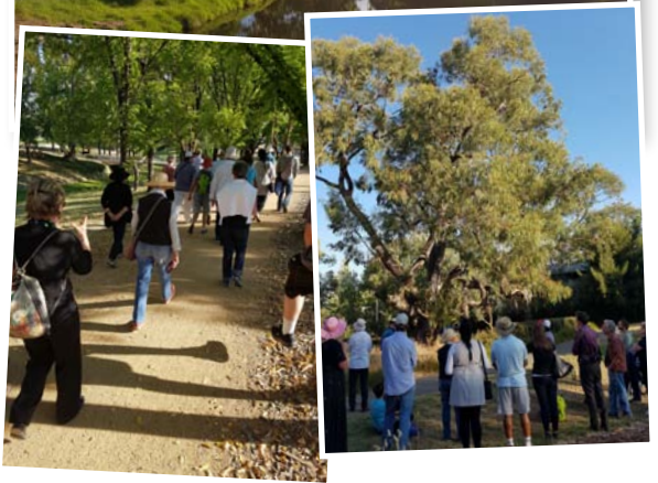
On 14 April 2016 the Australian National University launched its 'New Acton Aboriginal Heritage Trail' with a guided tour of the campus.