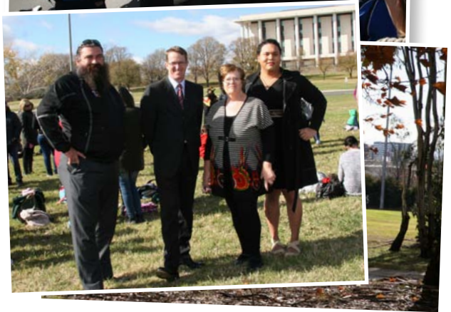
To mark National Sorry Day, many ORIC staff joined with others from across Canberra to participate in the National Sorry Day Bridge Walk across Commonwealth Avenue Bridge. The walk took place on Friday, 27 May 2016.