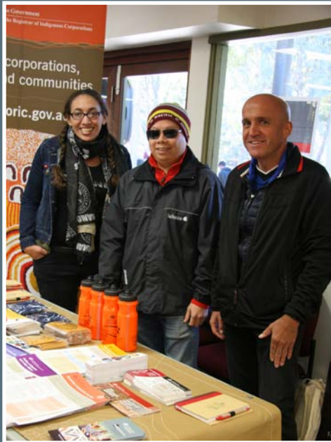
NAIDOC: Setting up the NAIDOC stall for the family day at Yarramundi Reach, Canberra.

Each year ORIC staff involve themselves in various activities and events.