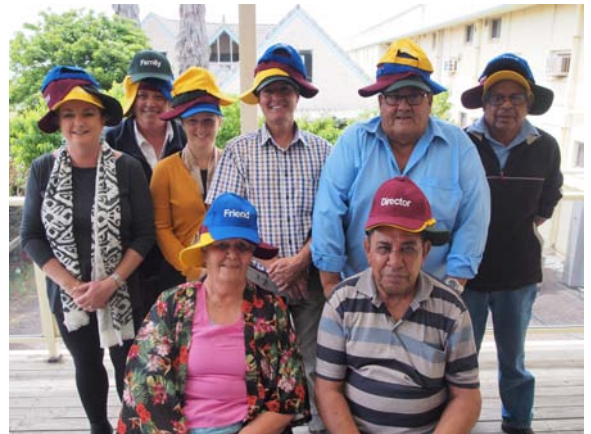
Role playing in many hats. Part of an ICG in November 2015 in Port Lincoln, South Australia

ORIC delivered eight ICG workshops across Australia in 2015–16. A total of 219 people, representing 85 corporations, participated.