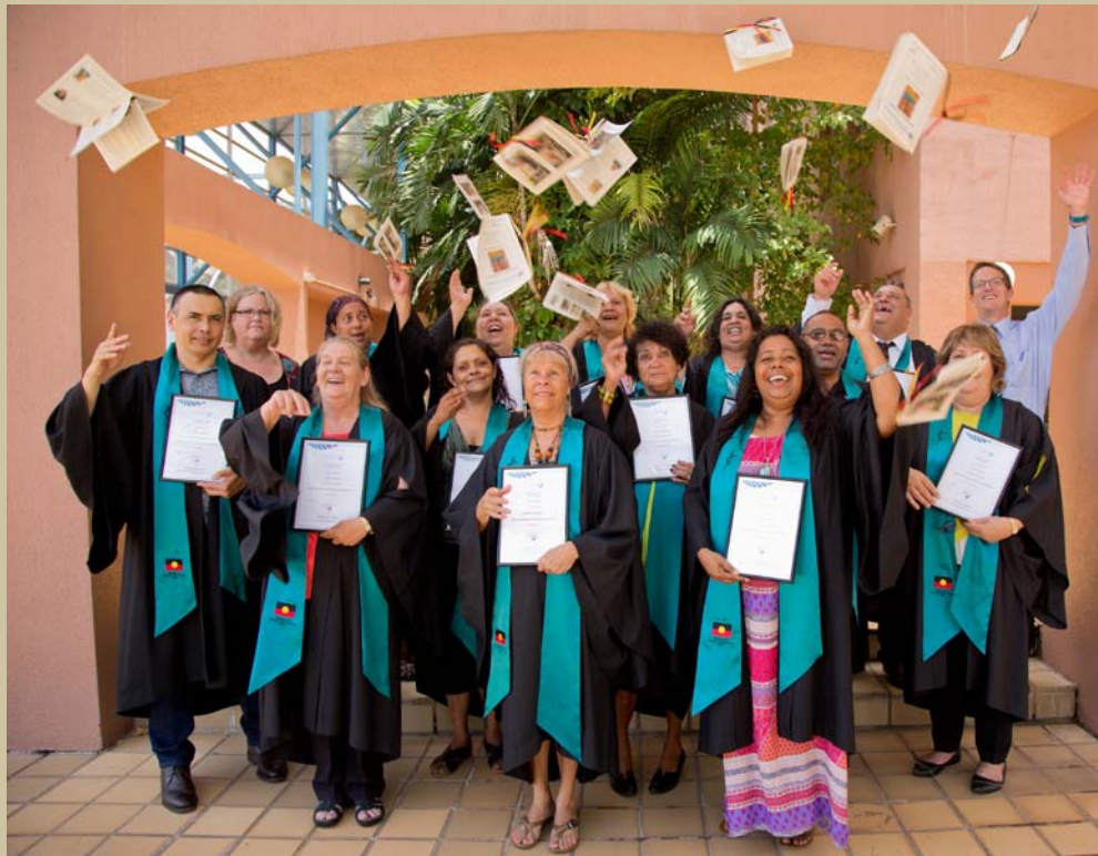
The graduation ceremony was held in Darwin on 20 November 2015.

The Diploma of Business (Governance). In his address the Registrar said, 'My office wants to see Aboriginal and Torres Strait Islander corporations succeed as effective, sustainable and accountable organisations with good, capable leaders at their helm. Today's ceremony recognises a small group who has shown real commitment. Each person has strived to get the most out of a tough course and now joins a growing number of Aboriginal and Torres Strait Islander people working hard to make their corporations and communities stronger.'