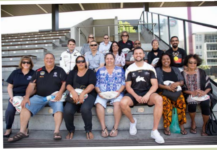
Above: At the training facilities at the South Sydney Rabbitohs.