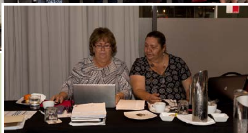
Course work in progress