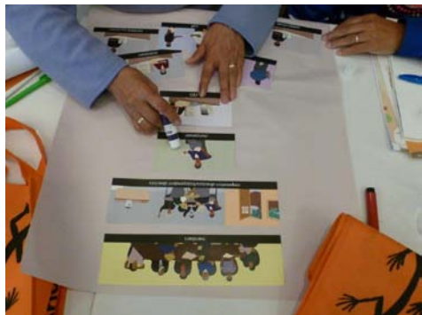
Learning about corporate governance in Tamworth, June 2016.