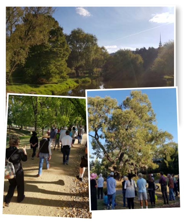
On 14 April 2016 the Australian National University launched its 'New Acton Aboriginal Heritage Trail' with a guided tour of the campus.