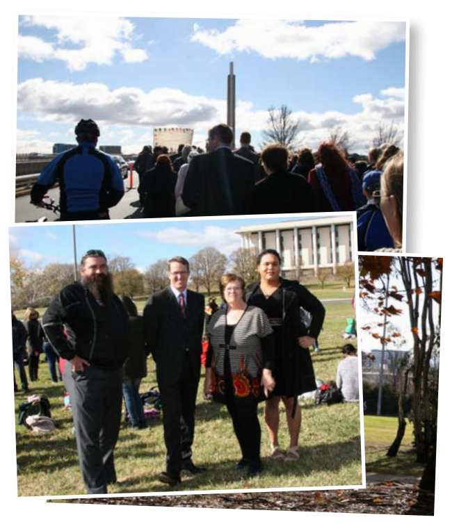
To mark National Sorry Day, many ORIC staff joined with others from across Canberra to participate in the National Sorry Day Bridge Walk across Commonwealth Avenue Bridge. The walk took place on Friday, 27 May 2016.