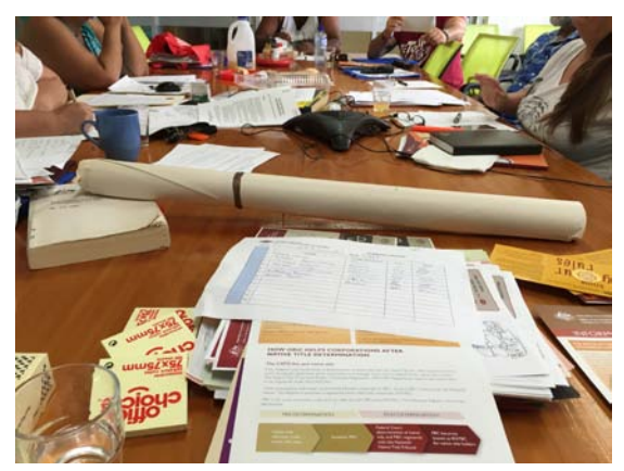
Native title discussion.

As at 30 June 2016 there were a total of 26 policy statements.