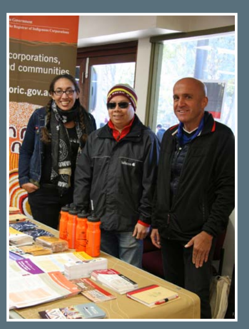
NAIDOC: Setting up the NAIDOC stall for the family day at Yarramundi Reach, Canberra.

Each year ORIC staff involve themselves in various activities and events.