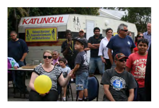
Community members at the hand back ceremony