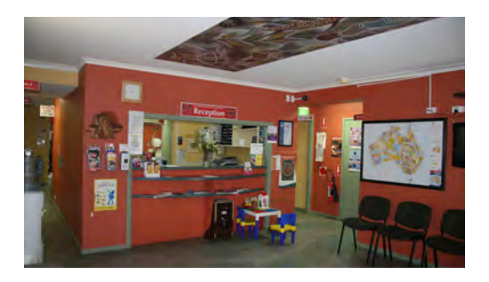
Reception area at Katungul

On 12 December 2011 Katungul was placed under special administration after an examination by the Registrar revealed some serious anomalies in the corporation's financial statements.