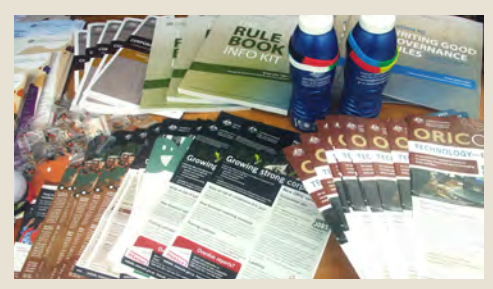
Above: ORIC wreath; ORIC staff at the 2012 Family Day NAIDOC stall and ORIC promotional materials