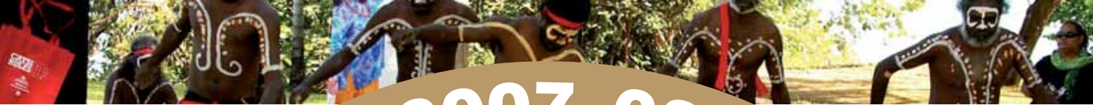
The Kenbi dance group performing at the CATSI launch.